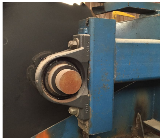
Ultra-Class on sawmill chain conveyor