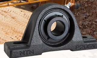
NTN Ultra-Class Mounted Roller Bearing Units

A major upgrade from standard SAFs in conveyors and bucket elevators