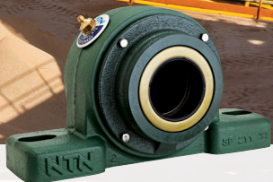
NTN SPAW/SPW Mounted Roller Bearing Units

A major upgrade from standard SAFs in conveyors and bucket elevators