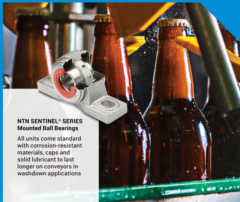
NTN SENTINEL® SERIES Mounted Ball Bearings

All units come standard with corrosion-resistant materials, caps and solid lubricant to last longer on conveyors in washdown applications