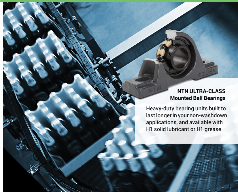
NTN ULTRA-CLASS Mounted Ball Bearings

NTN gives you the total package: products designed to exceed industry standards, expertise in training and installation, and readily available replacement parts through your local distributor at a moment's notice. After decades of experience in the industry, we know exactly what it takes to get the job done right.